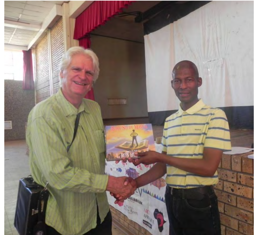
Presentations of materials were made to school executives.